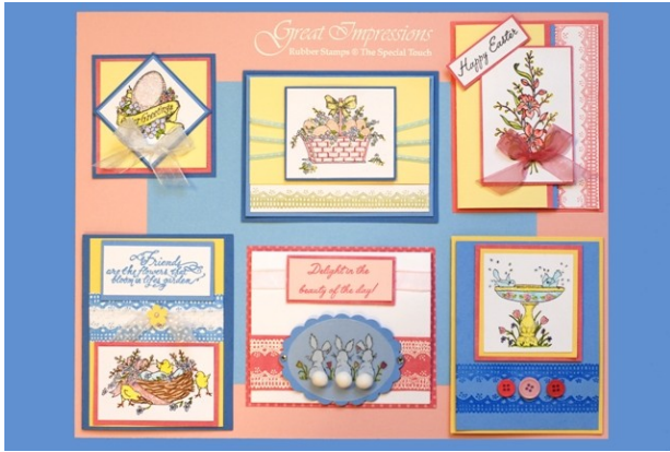
Stamp of the Month—February