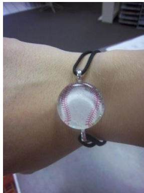
Glass Tile Bracelet