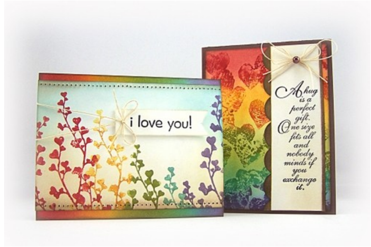
Penny Black Cards