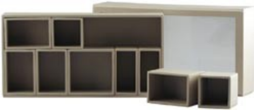
Tim Holtz Configurations Box