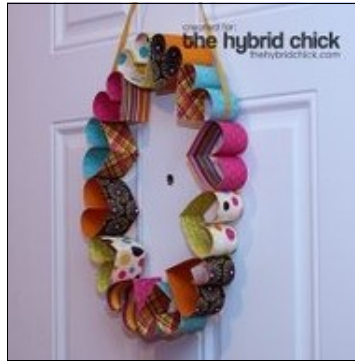
Kids Heart Wreath